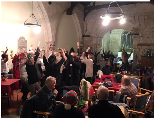
Skerne residents enjoying themselves at Christmas.